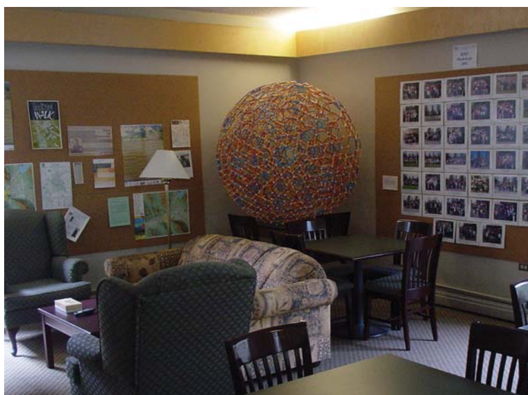
BIRS Common Lounge

The following objectives are being implemented for the upcoming phase of BIRS: