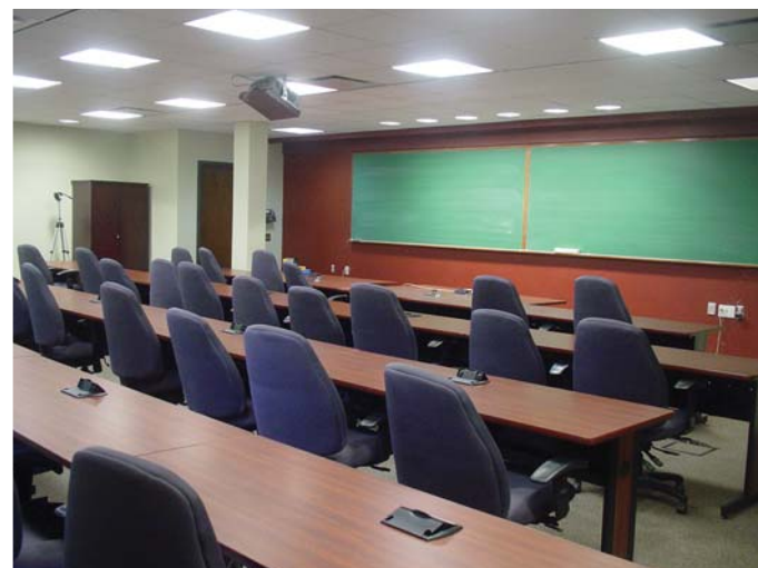
Max Bell 159 - Main Lecture Room